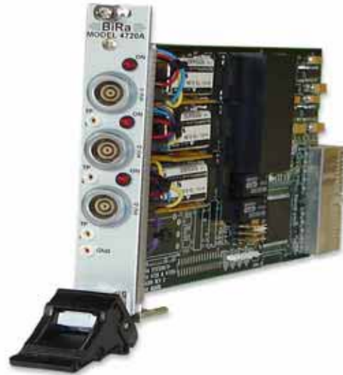
Figure 1: Model 4720A HV board produces 0 to -300 Volts in a CompactPCI package

single system. Instrumentation, data acquisition, machine vision, motion control, and bus interface modules are just a few types of CompactPCI modules available. It also provides a high-performance and a rugged industrial form-factor along with high compute density and higher quality components [1].