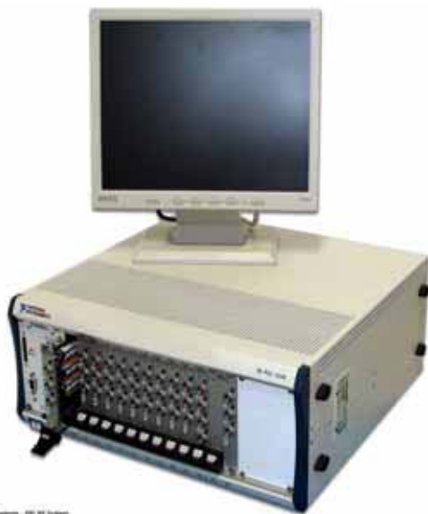
Figure 2: A CompactPCI/PXI chassis with High voltage boards.

The chassis selected for hosting these High voltage cards is National Instruments™ PXI-1044 which accepts both PXI and CompactPCI 3U modules. The PXI-1044 offers 467 W of available power across 14 slots with 25W of cooling for each slot provided by three fans running at 140 cfm. The chassis is PXI specification Revision 2.1 compliant. It is equipped with NI-8196 which is a high-performance Pentium M 760-based embedded controller for use in PXI and CompactPCI systems. The PXI-8196 include high performance peripheral I/O such as 10/100/1000 Base TX Ethernet, four USB ports, an RS-232 Port and an IEEE 1284 ECP/EPP parallel port. This allows the user to have a choice in selecting the peripheral for remote communications with the chassis. Additionally it comes with 512 MB dual-channel DDR2 RAM and Windows XP Professional already installed on it [1][2].